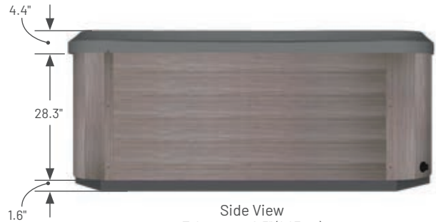
Side View Tolerance \pm 0.5" (1.27cm)