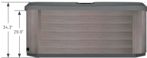
Front/Back View Tolerance \pm 0.5" (1.27cm)