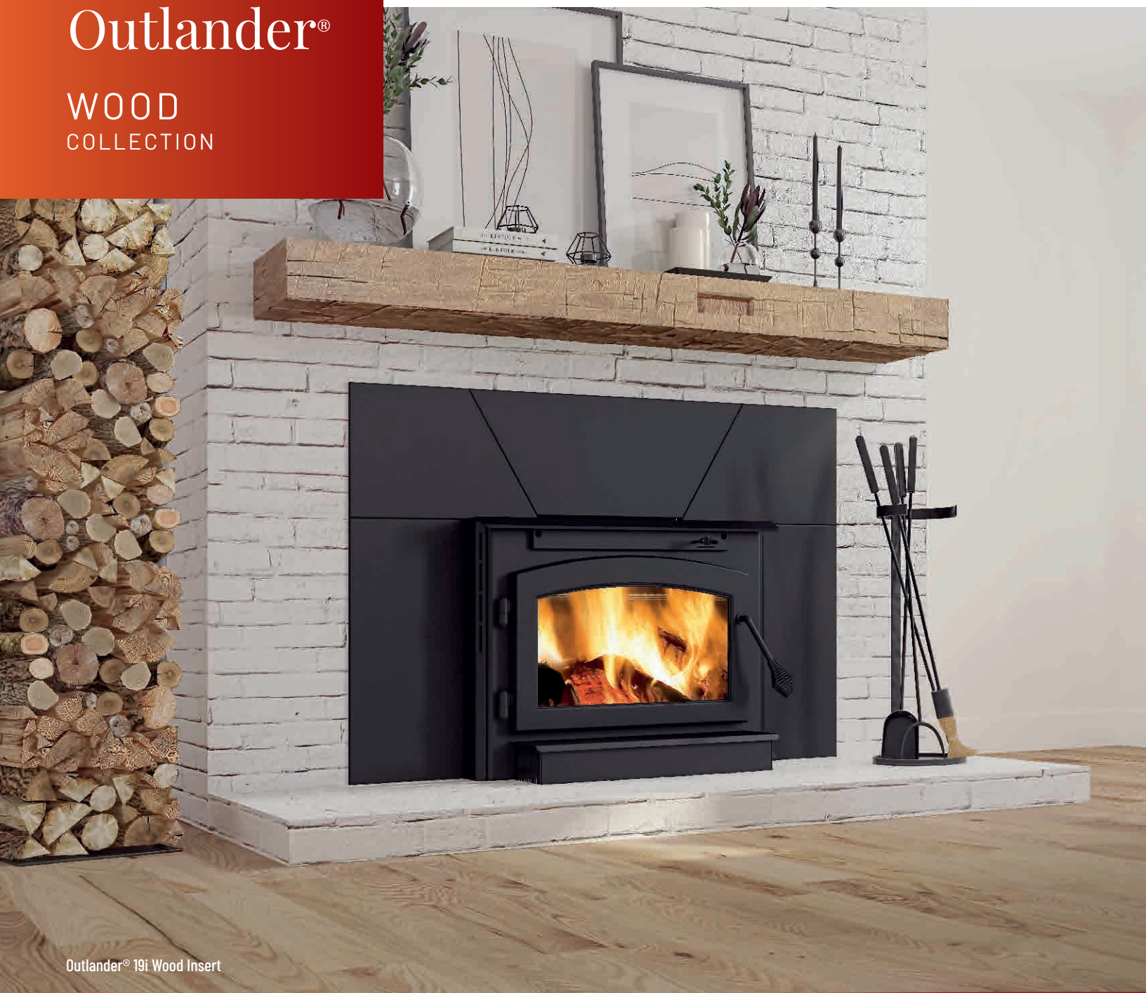
Outlander® 19i Wood Insert