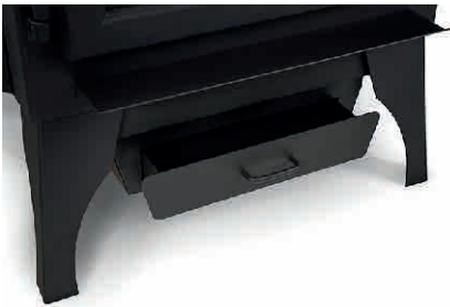
Leg and Ash Pan Kit

*Ash pan not offered on the 19i wood insert.