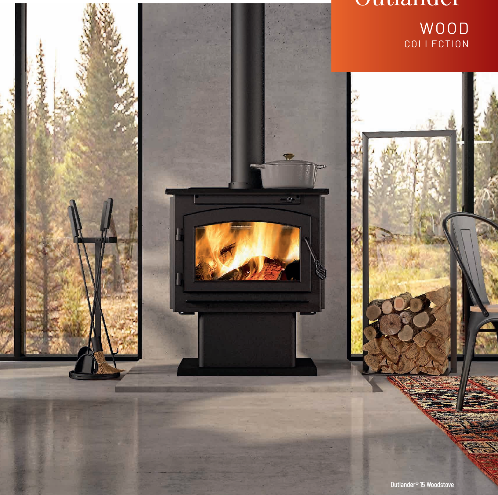
Outlander® 15 Woodstove