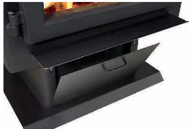
Pedestal and Ash Pan Kit

*Ash pan not offered on the 19i wood insert.