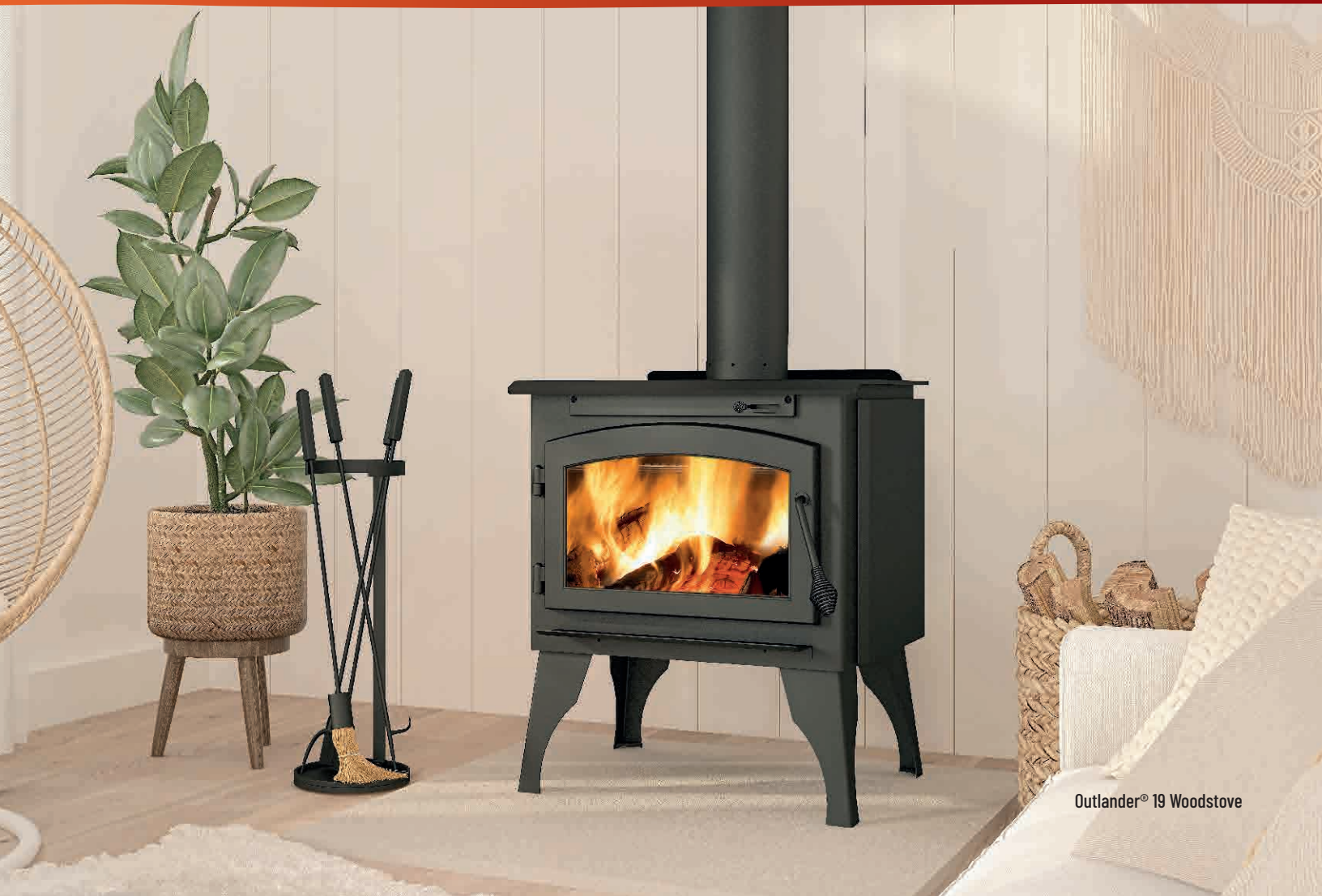
Outlander® 19 Woodstove

Heat activated and variable speed convection fan. The fan is included with the 19i wood insert. It is optional on the 15 & 19 wood stoves.